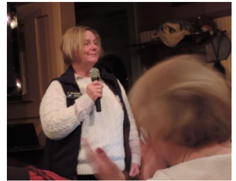
Commander, we have a quorum.